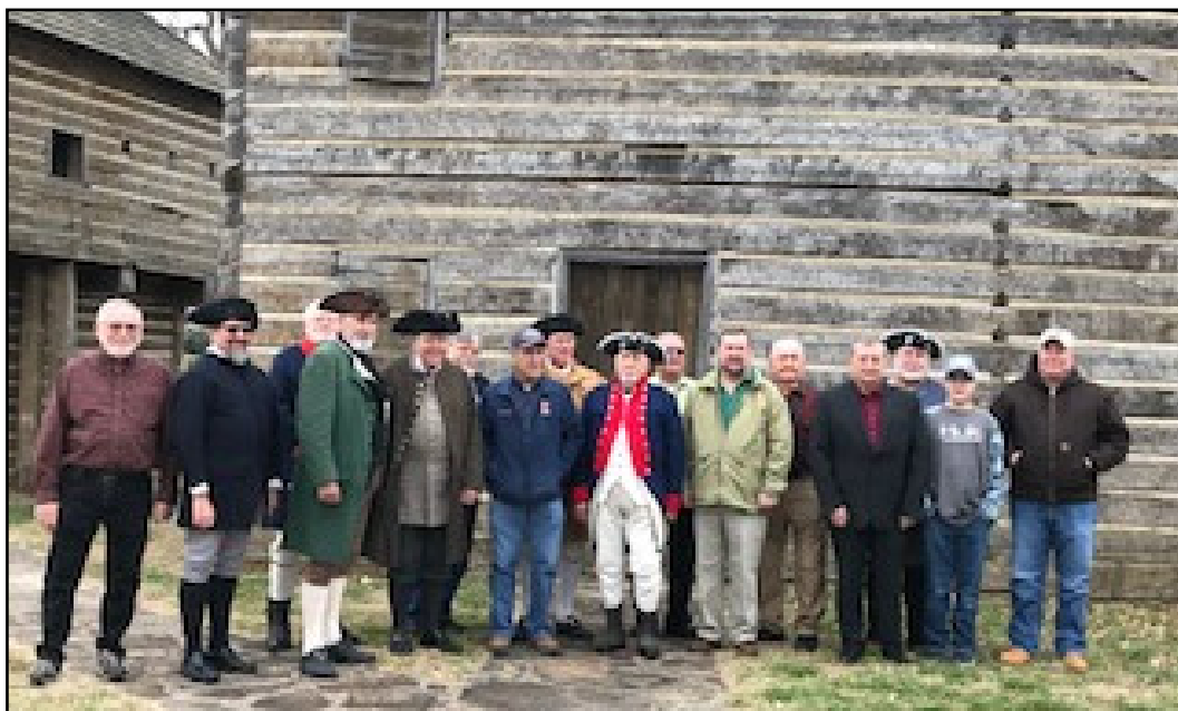
The Long Knives enjoyed a very fine catered meal and a warm stroll through the Fort Museum and a cold stroll outside. This is the third time that the Long Knives have held their Christmas party at Ft. Massac. We are hoping that it can become an annual tradition.

The Compatriots of the Long Knives Chapter enjoy not only the beauty of deep Southern Illinois, but also the rich historical significance of the Revolution itself. This year, the compatriots gathered once again for warm comradery and Christmas cheer. What could be a more fitting site to remember our Patriot ancestors than historic Fort Massac. For those that are unaware, the Ft. Massac grounds served as a location for early Spanish occupation (1540), French occupation (1757), British, and American occupation. In 1794 the rebuilt Fort served as a base during the Northwest Indian War. In 1803, Lewis and Clark utilized the Fort for resupply. Fort Massac is Illinois' first State Park, and today is a very important historic site.