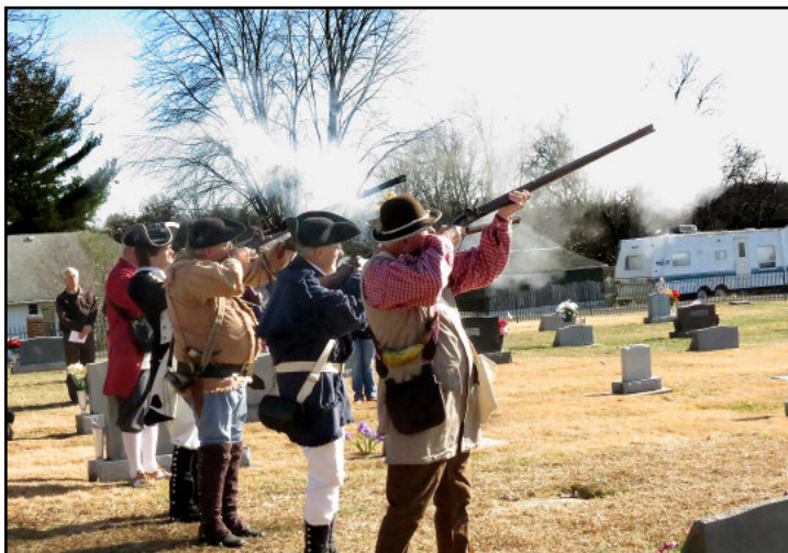
Members of the GGRC Chapter color guard fire their weapons in a salute to the fallen.