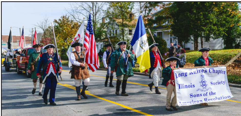
On November 11, 2017 the Long Knives Chapter marched in the Veteran's Day Parade in Anna, IL. The Long Knives Chapter has a long tradition of marching in this parade and they will continue that tradition going forward.