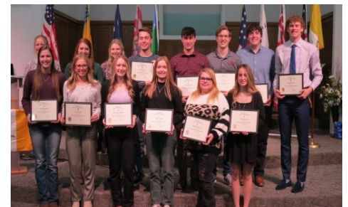
After a two year hiatus, Ewington chapter held their Outstanding Citizenship Award Ceremony on March 29, 2022.