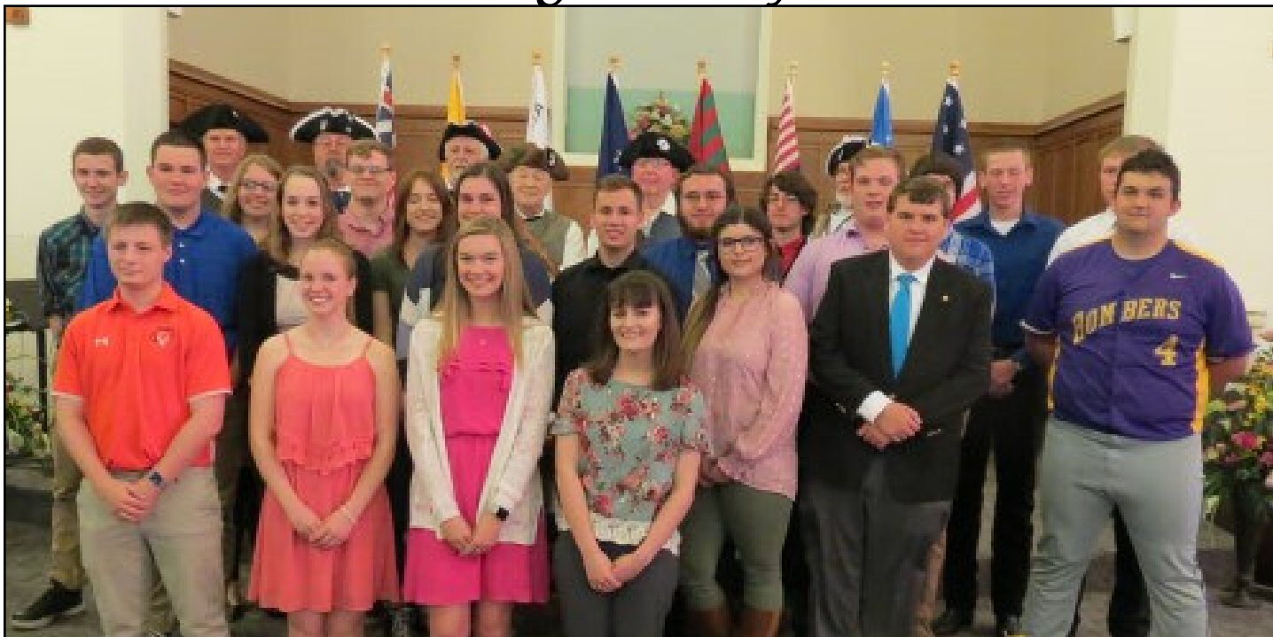
35 Effingham area high school seniors were awarded Outstanding Citizenship certificates and pins in April.