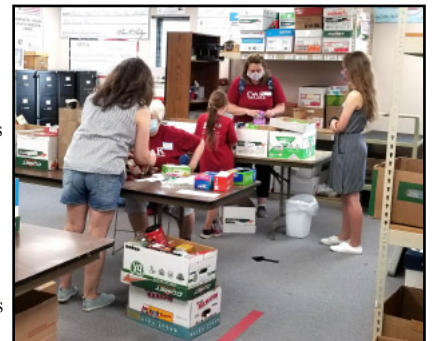
CAR members busy packing the boxes.

After assuring that everyone was healthy and safe, we went straight to work - with members labeling items, making letter and hygiene kits, and preparing the assembly line. Once everything was ready, we began the packing process! It warmed my heart to see fellow C.A.R. members growing in confidence and getting excited about the work they were doing. When we can be involved at every step of the process and see an empty box turn into something tangibly impactful, I think we can awe ourselves with the magnitude of our service.