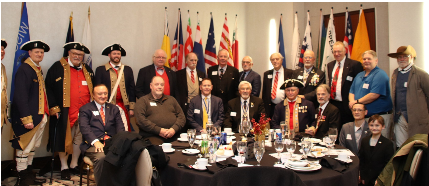
The Illinois Society was honored to attend the Holiday Party hosted by the Morgan-Kosciuszko chapter of the Wisconsin Society SAR, the Society of the War of 1812 of Wisconsin, the Wisconsin Society of the Order of the Founders and Patriots of America, and the Society of Colonia Wars in the state of Wisconsin.