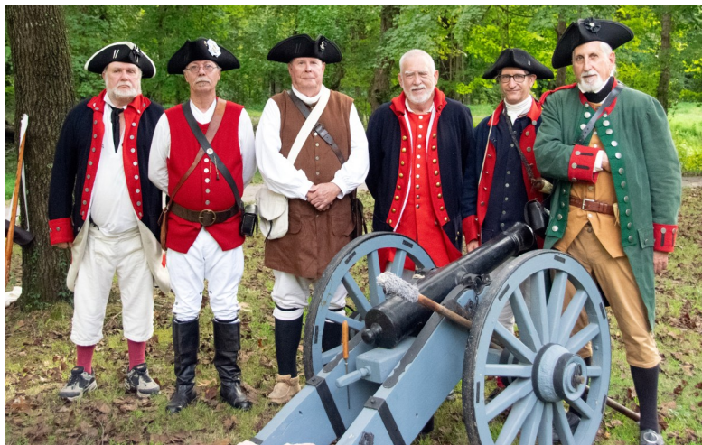
Long Knives Cannon crew at Constitution Week Celebration in Jonesboro